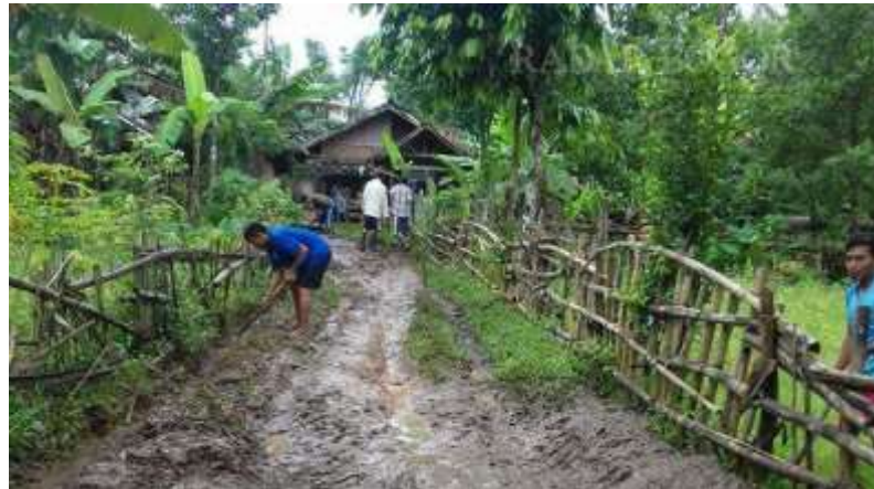
Figure 1. Loc: Cimalang, Babakan's lurid road

Miscellaneous village's finance-allocation campaign is quite worthless. Minister of National Development Planning Republic of Indonesia †† (2017) embroiders half-decade RPJMDes congruence (2005-2025 formulation) enlightened via Achievement Expectancy which it's seemingly price-nothing: